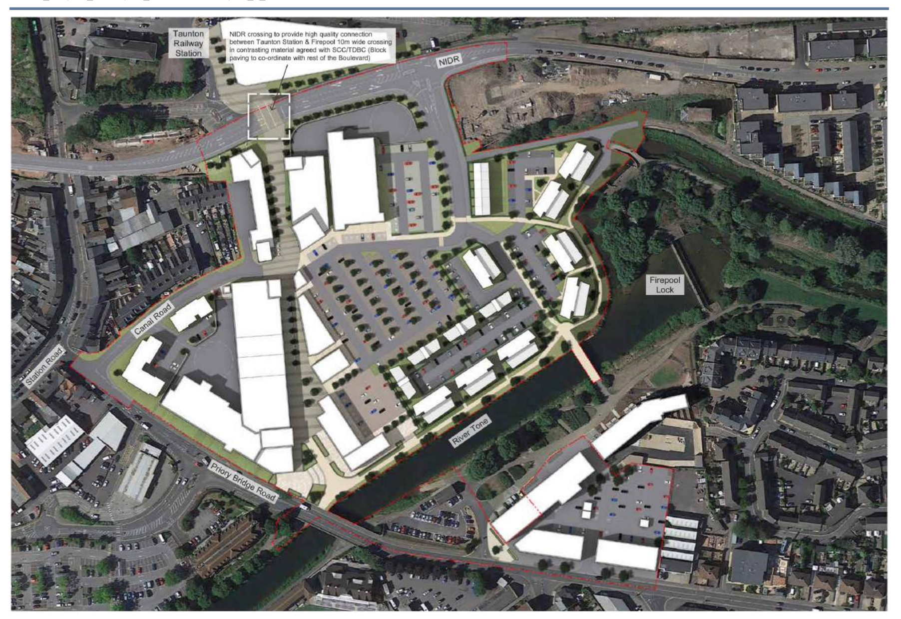
Figure 5.1: Firepool Masterplan for Reasonable Alternative 1