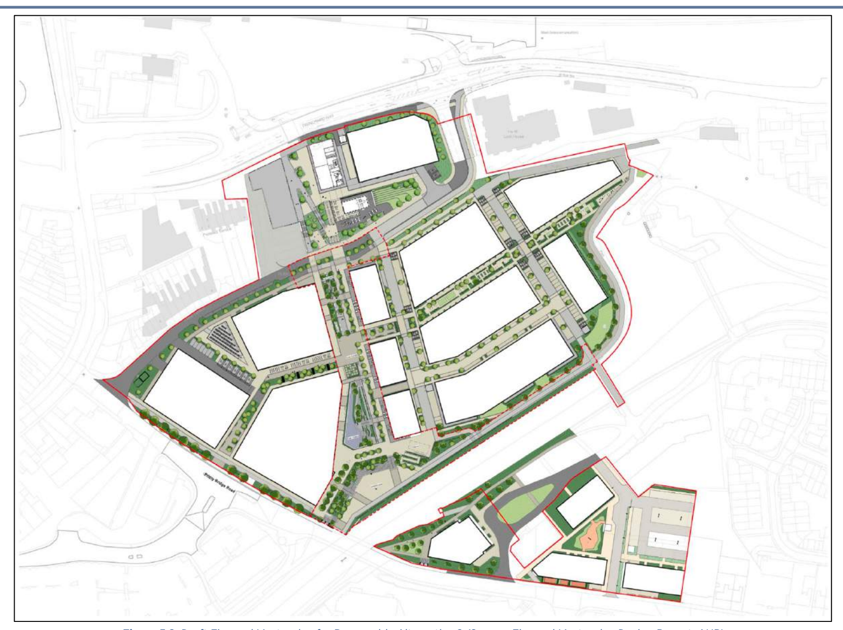
Figure 5.2: Draft Firepool Masterplan for Reasonable Alternative 2